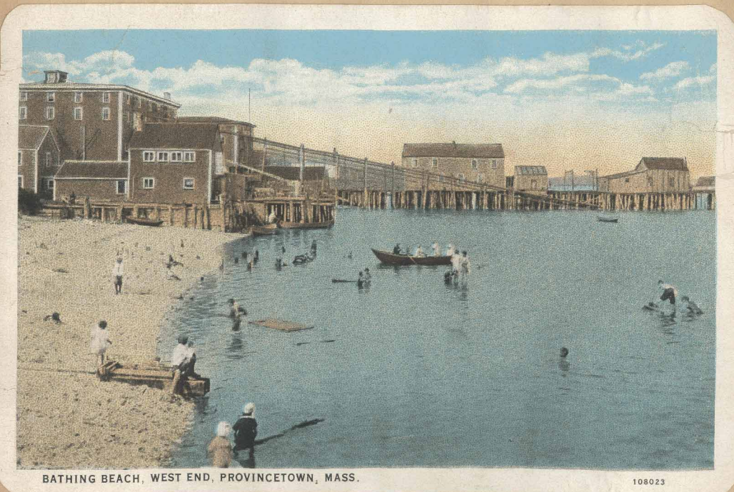
BATHING BEACH, WEST END, PROVINCETOWN, MASS.