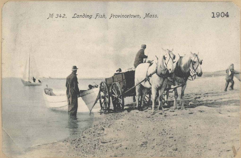
No 342. Landing Fish, Provincetown, Mass.