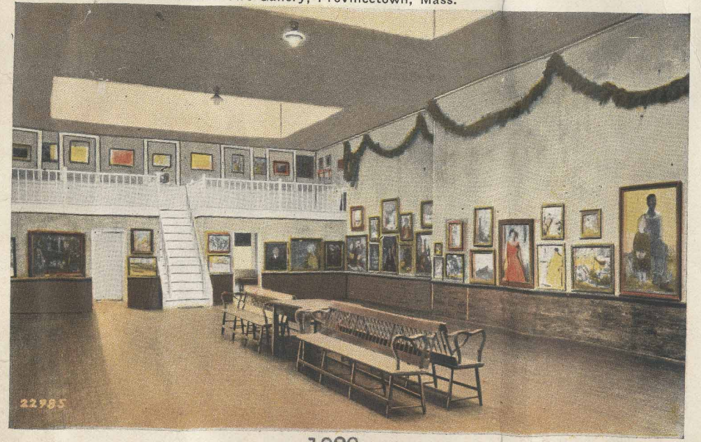
- 1929 -