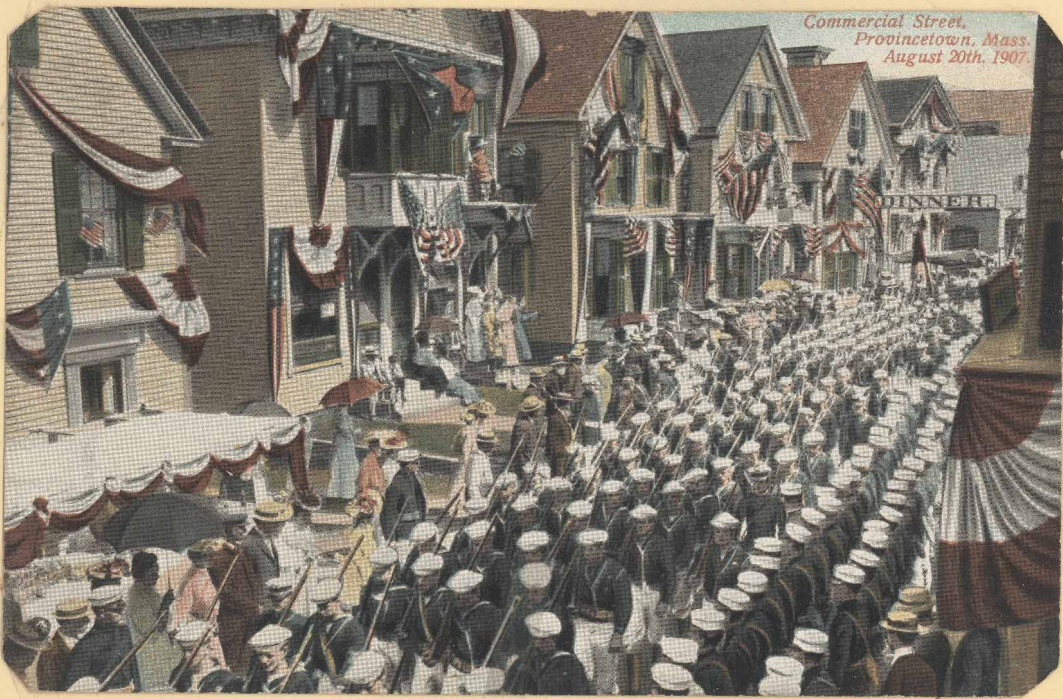
Commercial Street, Provincetown, Mass. August 20th, 1907.