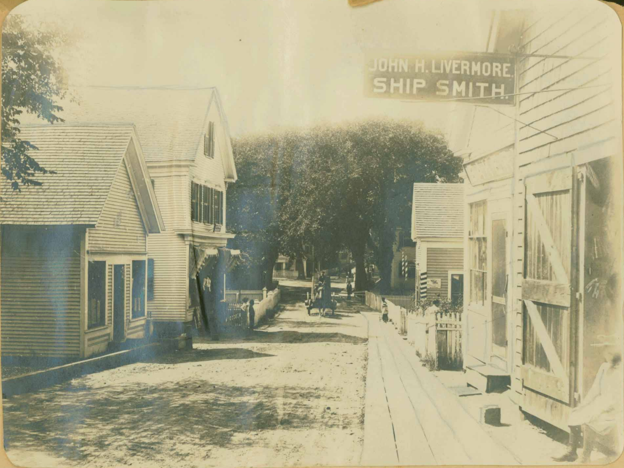
From Pleasant Street toward's the turn, or Lancy's Corner. - About 1890 -