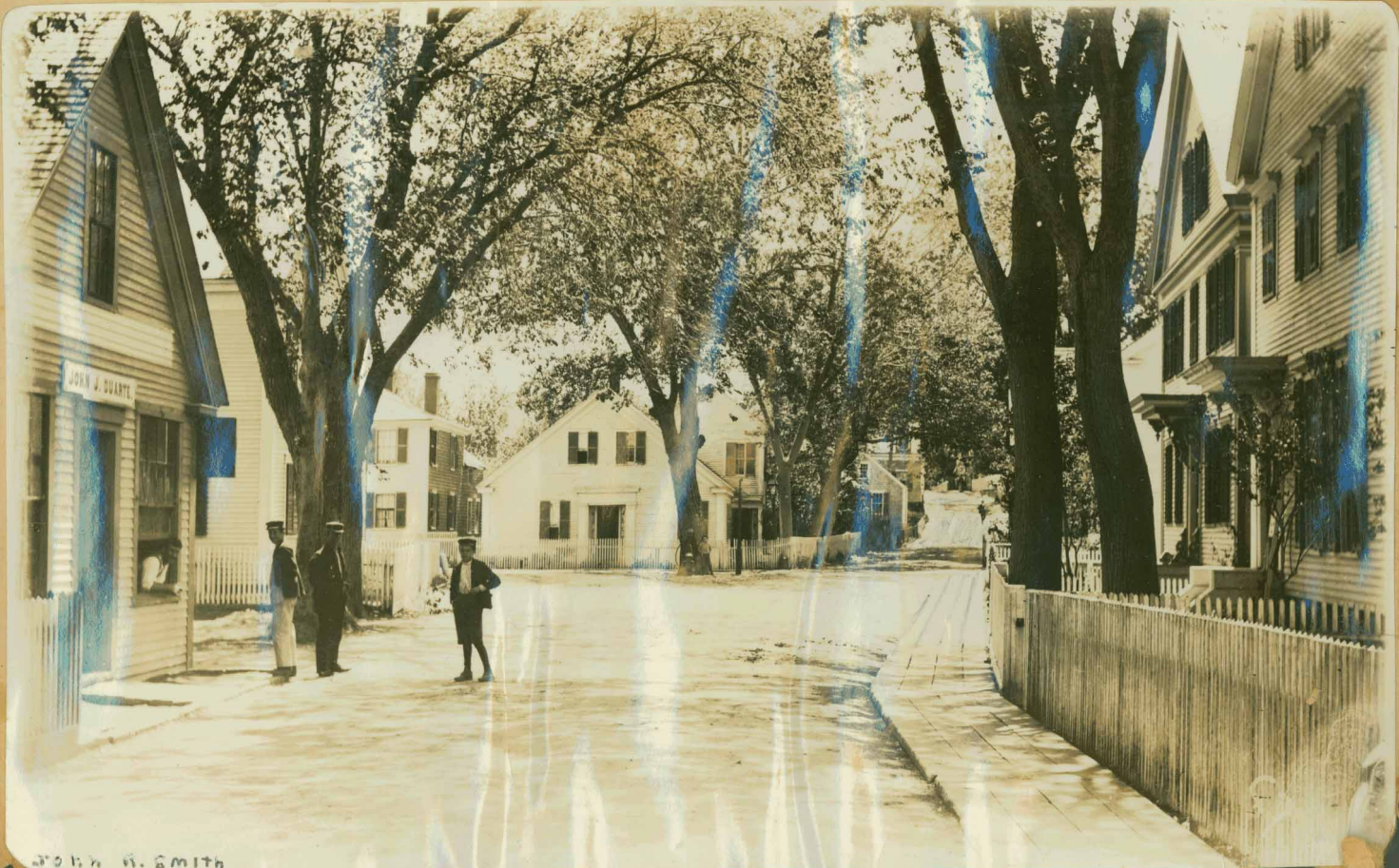
- About 1910 - Located about where Duarte's Shoe Shop is in the picture below.

Cape Cod Cold Storage Co., Provincetown, Mass.