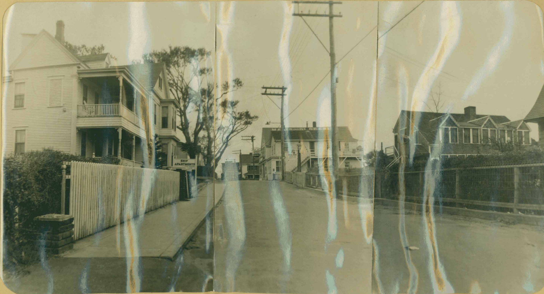
Facing East, and Burch's Market. Right: Flagship Restaurant. September 1945.