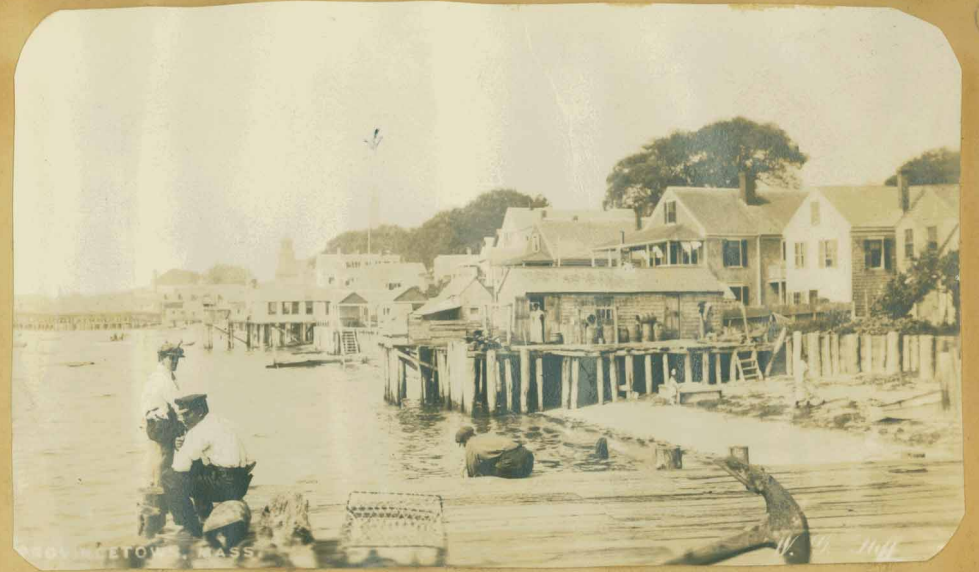
Facing West from opposite Kiley Lane - 1930. Pickert's Canning wharf, cupolas over man's head. MONUMENT (ARROW) left. Center Methodist Church next. The Peregrin, Nautilus and Standish Cottages on right. Note pigsty in center (see postcard on next page for location.)