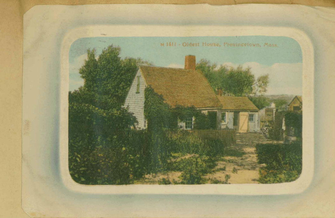
This used to be Provincetown's Oldest House, and was on Montello Street (next street after Pleasant St., coming East). Card was dated 1911

Pleasant Street, left and right, just before the Governor Bradford School. Monument in the background.