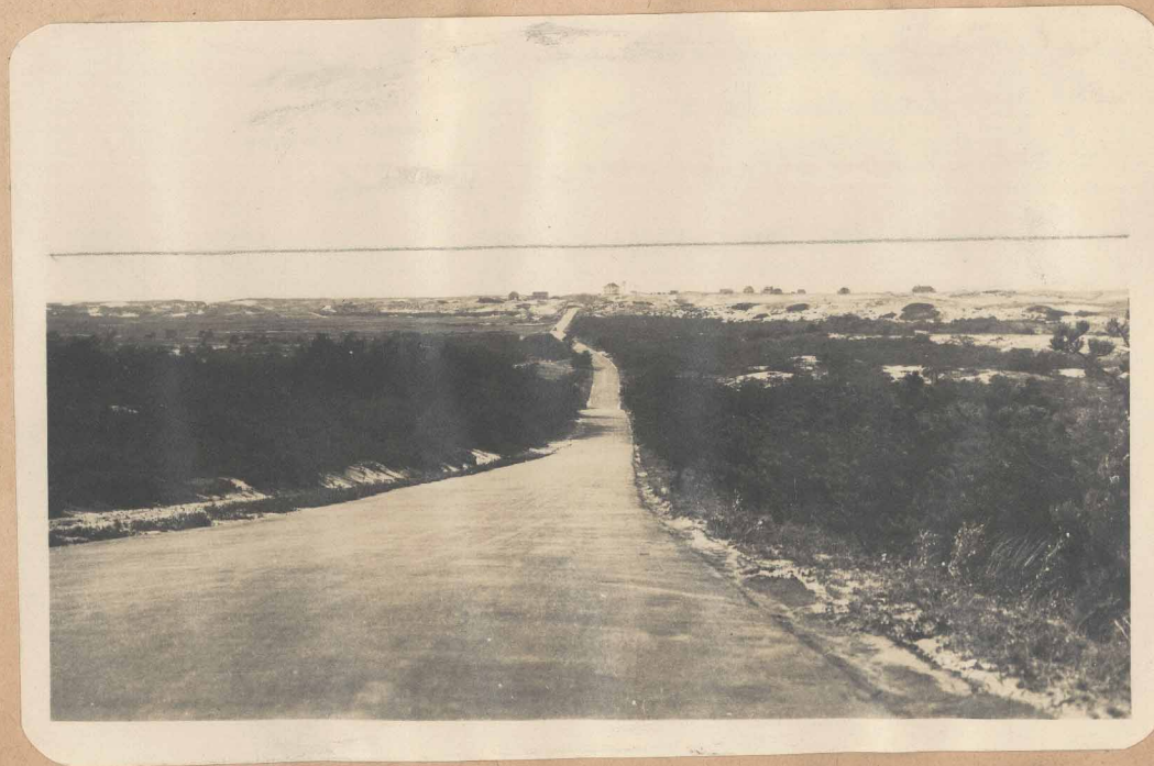
of the same scene about 1925. Summer cottages to right of the Station.

Let's detour again and go out to the Coast Guard Station at Race Point. /