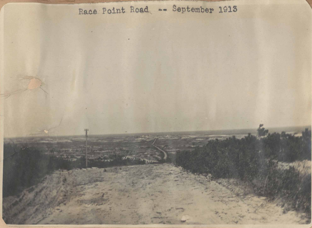
Just a sandy road at that time. Coast Guard Station in center Taken from a little ahead of sign in picture at left. We call this Sunset Hill.