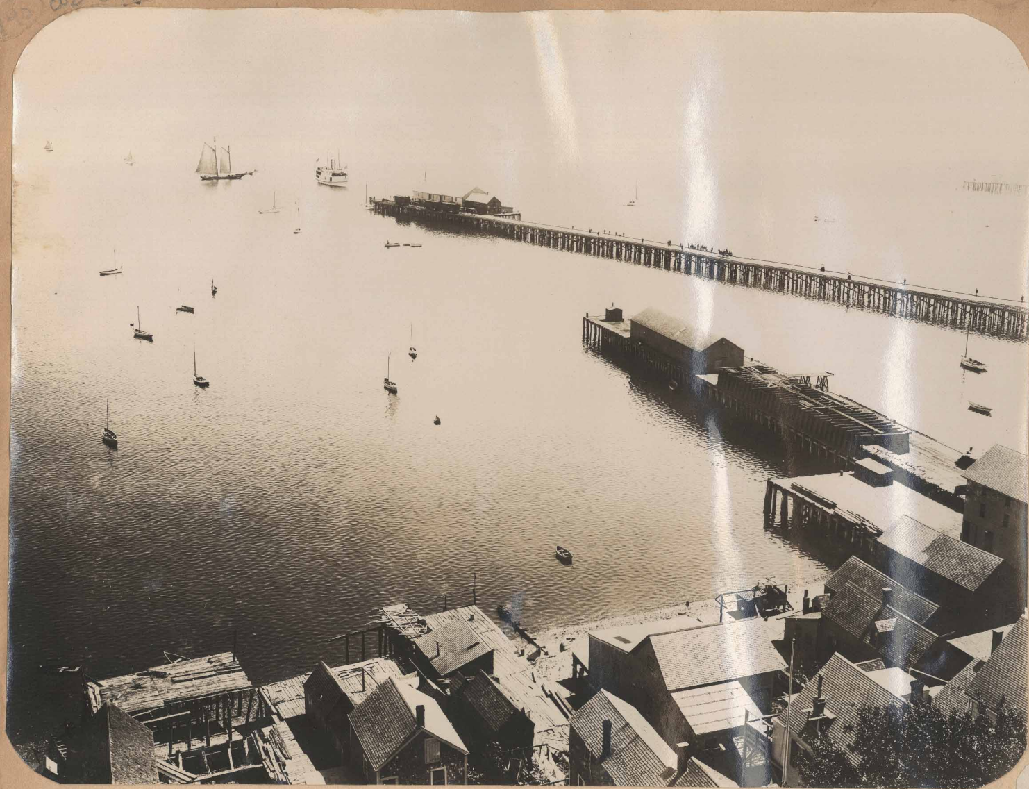
The Harbor from the Center Methodist Church Steeple -- About 1900. Steamer Cape Cod coming in to Railroad Wharf. Note freight cars on end of dock. Hilliard's Wharf, left.