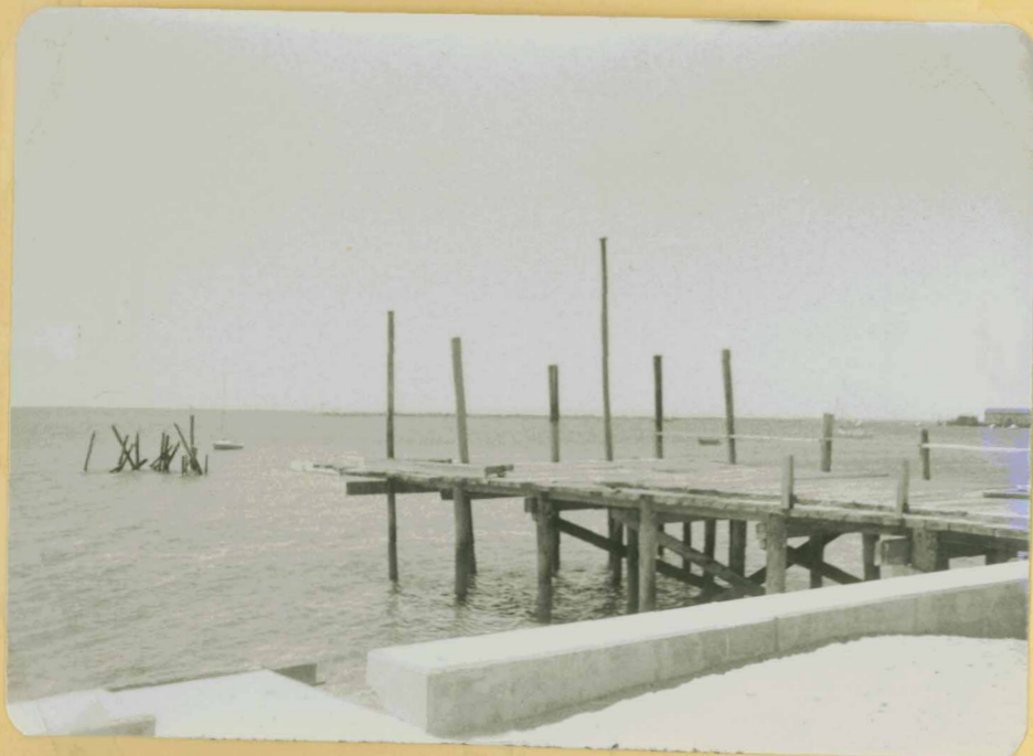
Another view of the remains, facing West - Aug. 1981