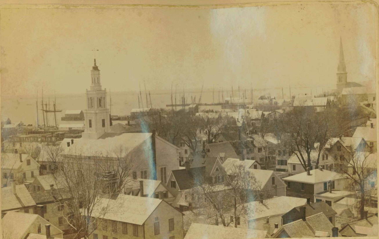
* PROVINCETOWN. 50