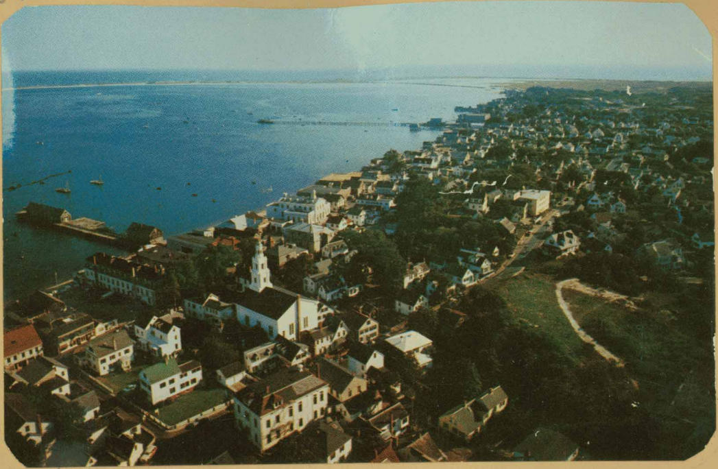
1954 version of picture on the left. Towne House (or the old Central House) on left. Universalist Church with the Post Office on its right. The Marine Hall in the foreground. Gifford House big white house on right of picture. Wood End Coast Guard at end of West End Breakwater. Wharves: Colonial Cold Storage, left; Cape Cod Cold Storage, right. Taken from Top of the Monument.