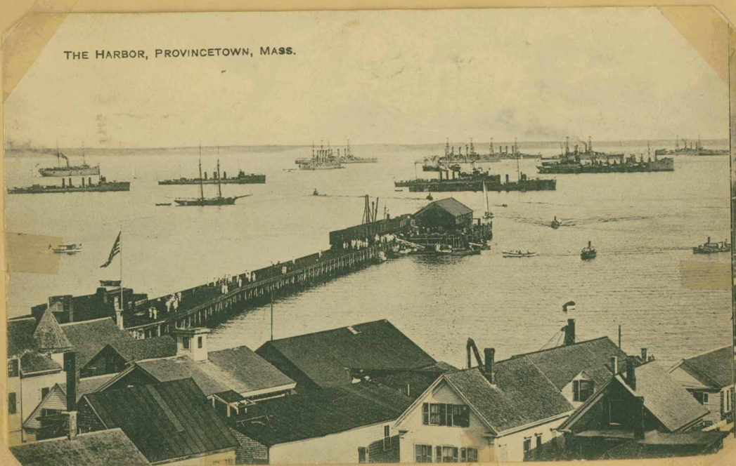
THE HARBOR, PROVINCETOWN, MASS.