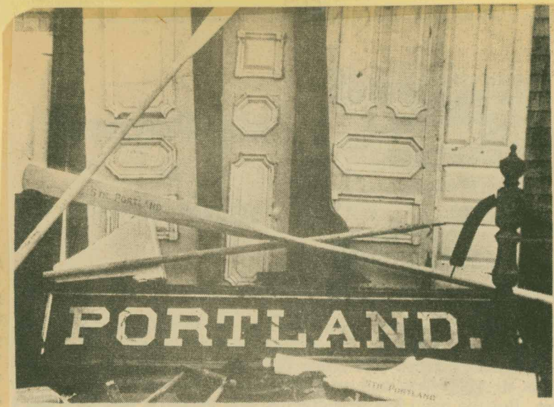
FLOTSAM FROM an ill-fated steamer, gathered by beachcombers.