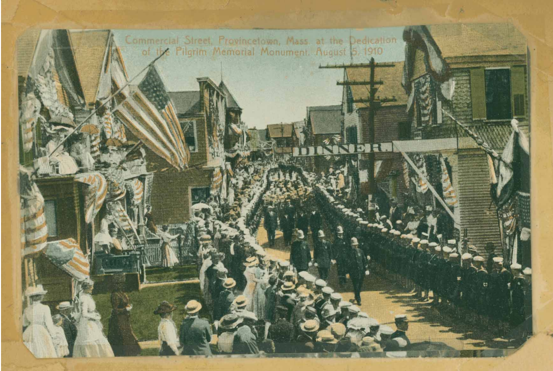
On the way up Monument hill to the Laying of the Corner Stone. Taken by Ryder Street