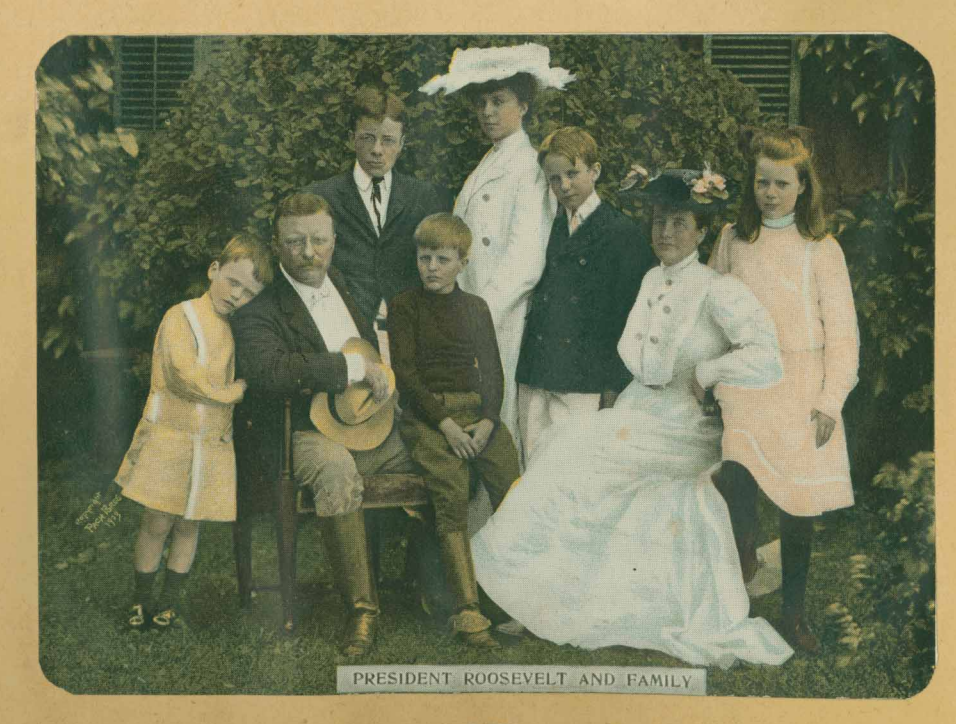
- 1907 -