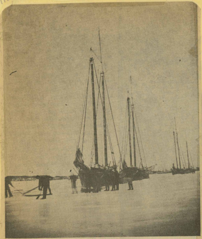
There's no record of which cold winter froze these schooners into the ice. It was a near-calamity for fishermen who could not go out, who faced the possibility the ice would crush their boats. With the Provincetown shoreline in the background, and men with ice saws working ahead of the boats, it suggests that they were making every effort to saw a channel that would let the boats regain the open ocean.