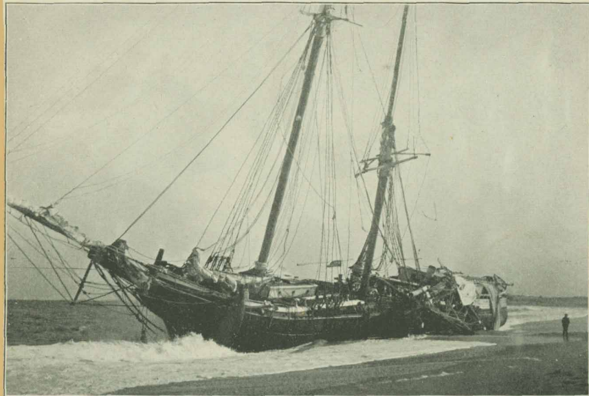
A BAD WRECK.

Another historic wreck was that of the pirate ship Widdah , which was lost near the site of the Cahoon's Hollow Life-Saving Station in 1718. The ship was commanded by Captain Bellamy, and carried twenty-three guns and a crew of one hundred and thirty men. Captain Bellamy had captured seven vessels off the shores of Cape Cod, and on one of them had placed seven of his crew. The captain of the captured ship ran his vessel close to the shore, and the seven pirates were taken prisoners. Later six of them were executed in Boston.