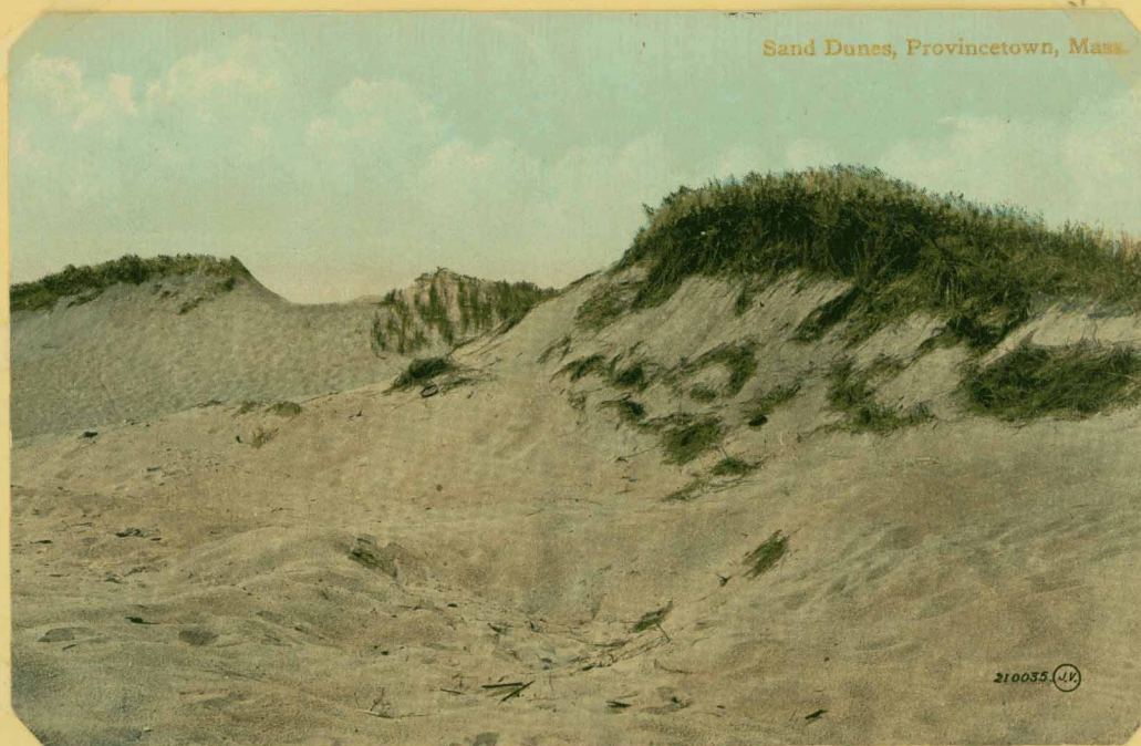
Sand Dunes, Provincetown, Mass.