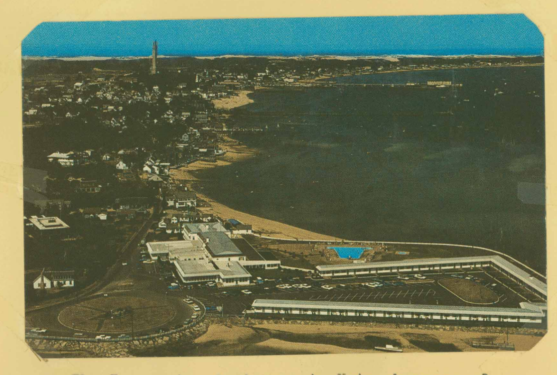
The Inn again, facing east. Note abscence of the many wharves there used to be. - 1965 -

Provincetown Inn from the air, 1965. Note Race Point Light far left.