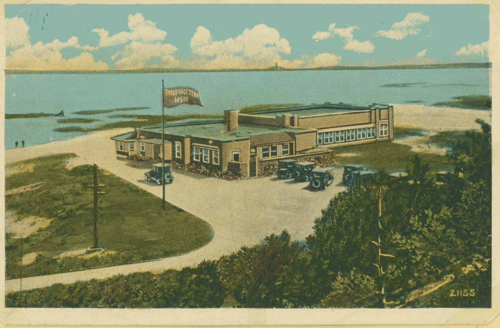
Provincetown Inn as it was in 1924

Provincetown Inn on the Sands, Terminal of the Kings Highway, Provincetown, Mass.