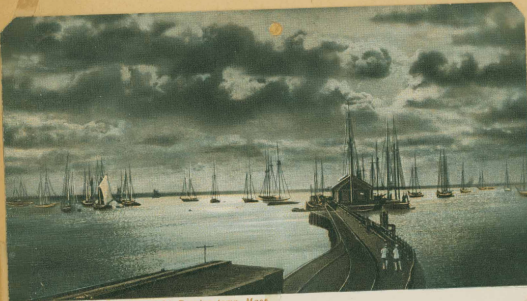
12100-R. R. Wharf by Moonlight, Provincetown, Mass.