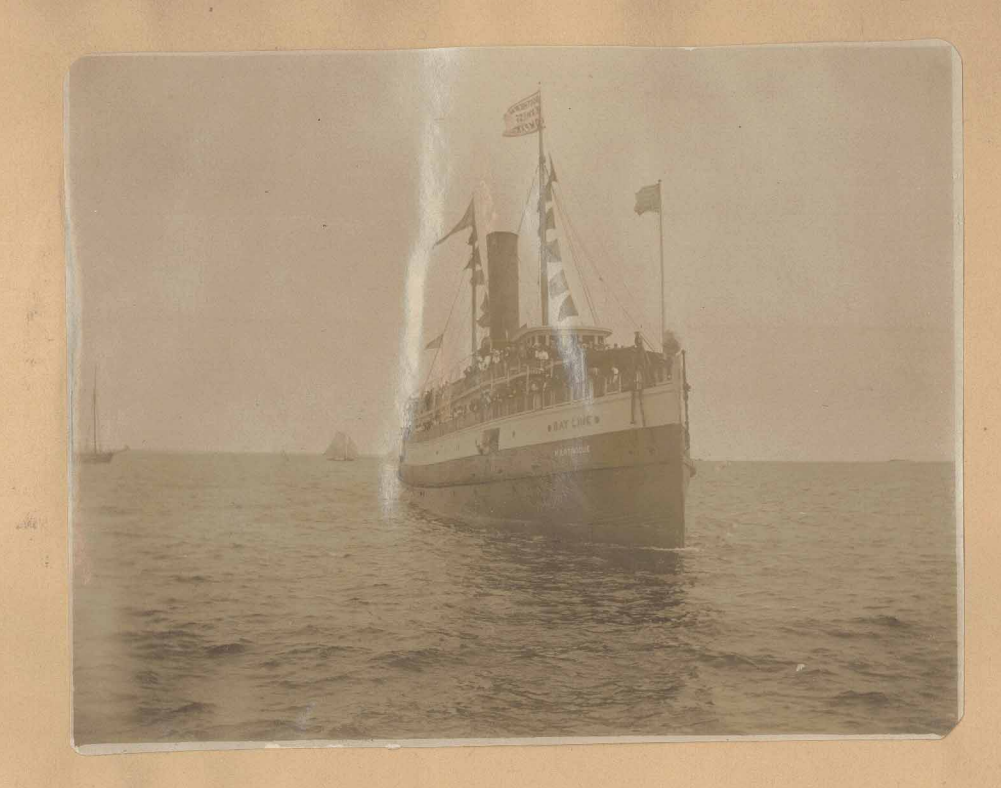
The Martinique. - About 1910