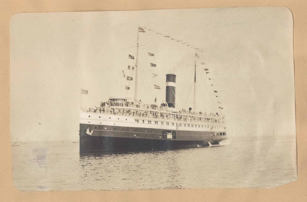
The Governor Cobb