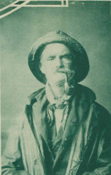
Above — Dauntless of gaze, defiant of chin, this typical, sou'westered veteran mariner is a reminder of gallant far-off days when all the Cape sailed out for cod.