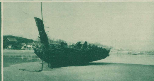
Above — The waves have had her now, the winds have searched the crannies of her creaking sides. In picturesque abandonment she rests on Provincetown sands.