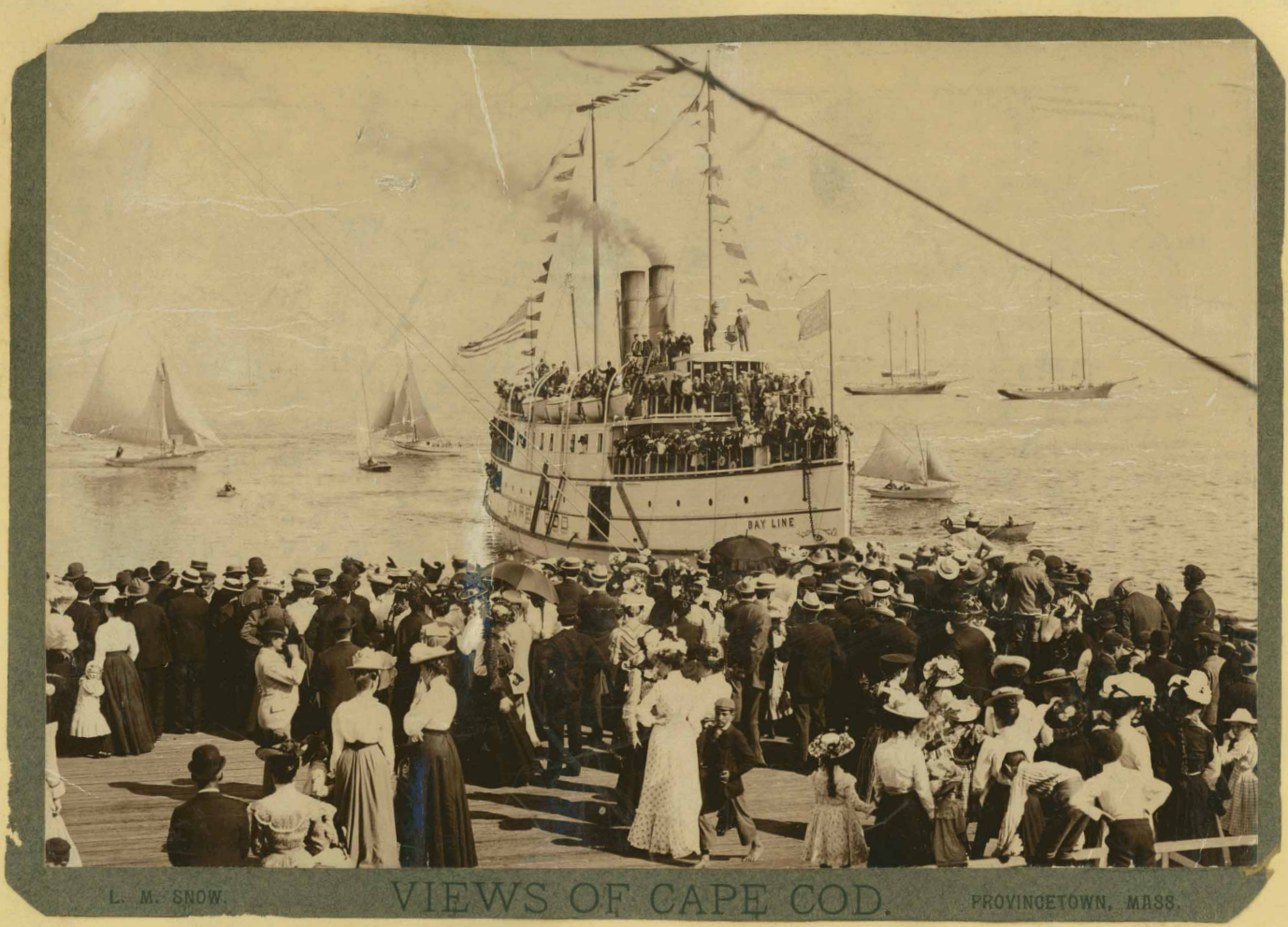
VIEWS OF CAPE COD. PROVINCETOWN, MASS.

Presented with compliments of Boston, Plymouth, and Provincetown Steam- boat Company