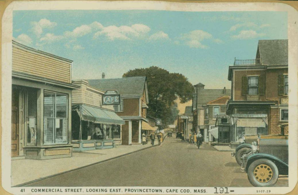
41 COMMERCIAL STREET, LOOKING EAST, PROVINCETOWN, CAPE COD, MASS. 191-