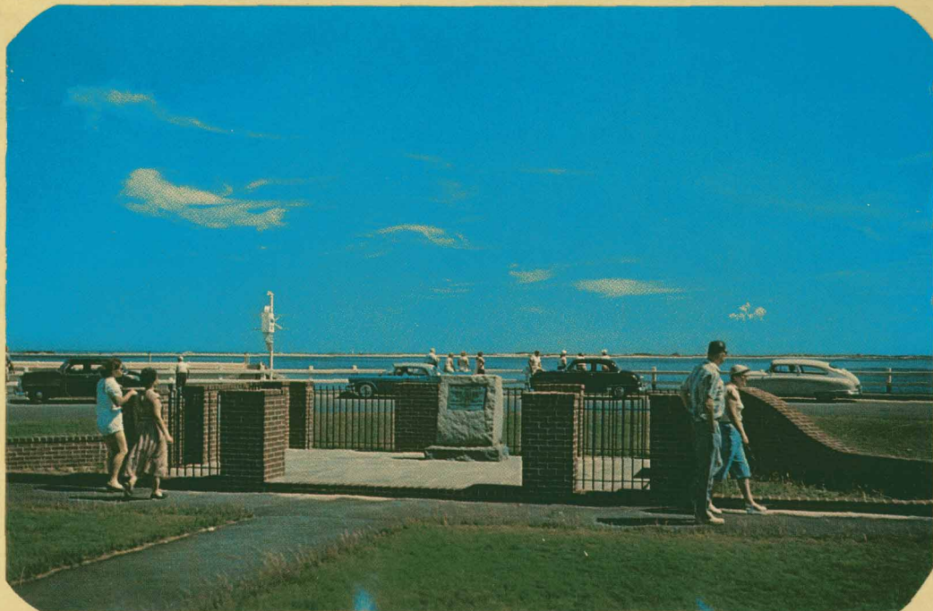
Stone marking landing place of the Pilgrim Fathers. Provincetown, Cape Cod, Massachusetts.

Opened for traffic this week was the new rotary at the West End which is expected to be a boon to traffic as soon as Commercial Street is made one-way from West Vine Street. Now being restored is the red brick memorial to the First Landing of the Pilgrims in the center of the large circular area. In the center of the picture is the Provincetown Inn with its new dress of white paint and above are town wharfs bare-legging out over the flats at low tide. At a traffic meeting Monday night all attending favored the one-way traffic on Commercial Street. Another hearing will be held in Caucus Hall Monday night.