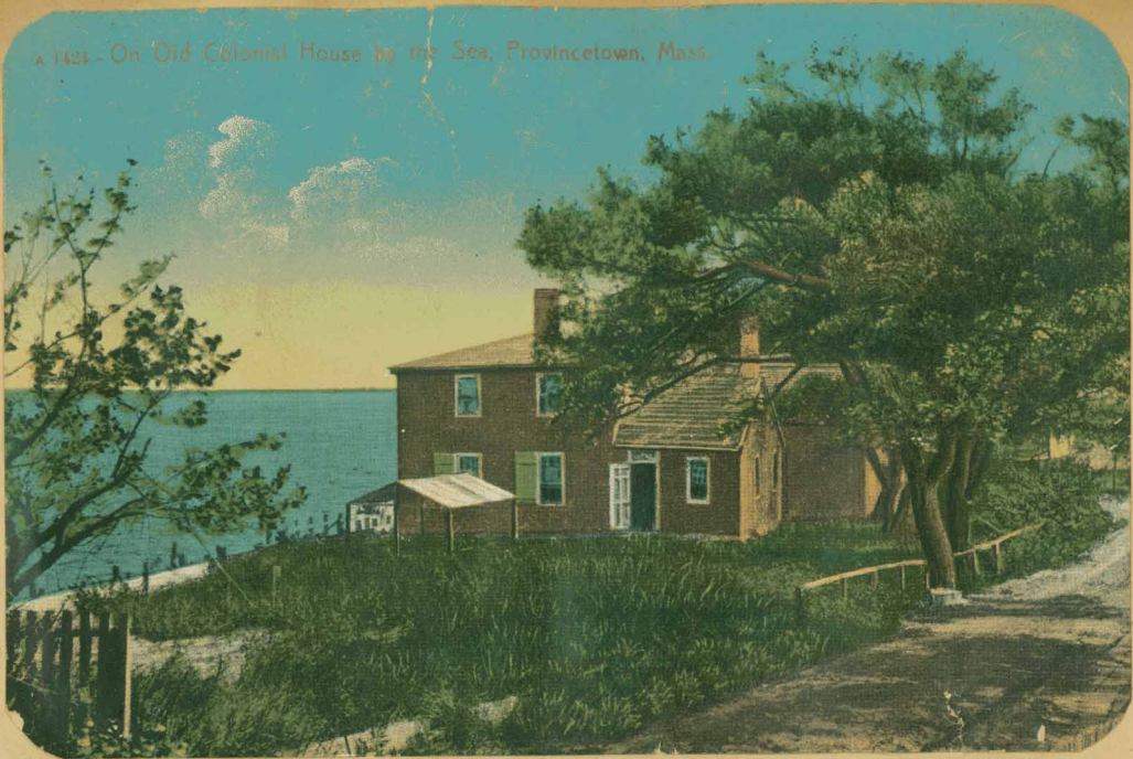
About 1909 - This is now The Red Inn