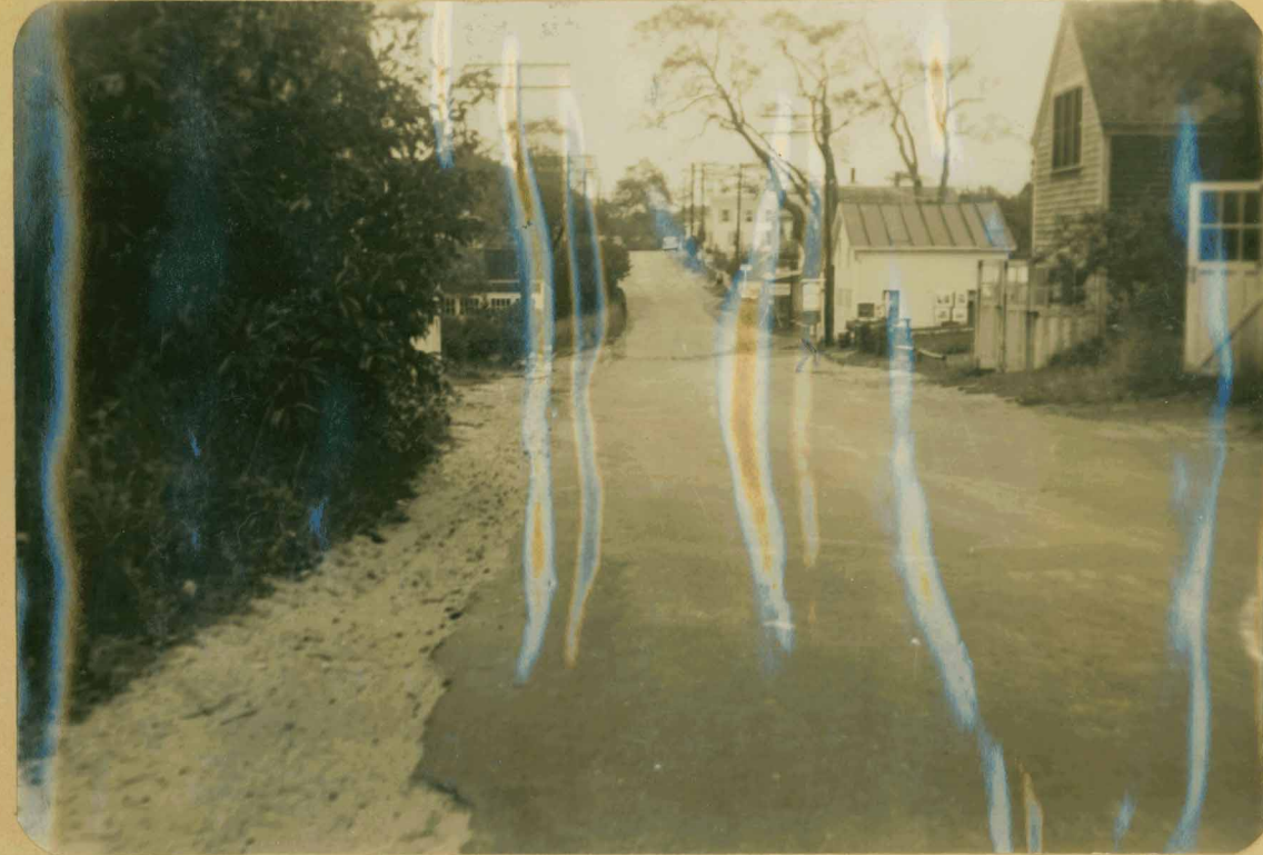
Facing west. Arrows: Kendall Lane, left, and Atkins-Mayo Road, right.