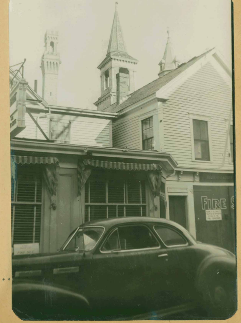
The Three Towers ... The Monument Pilgrim Church Town Hall September - 1947