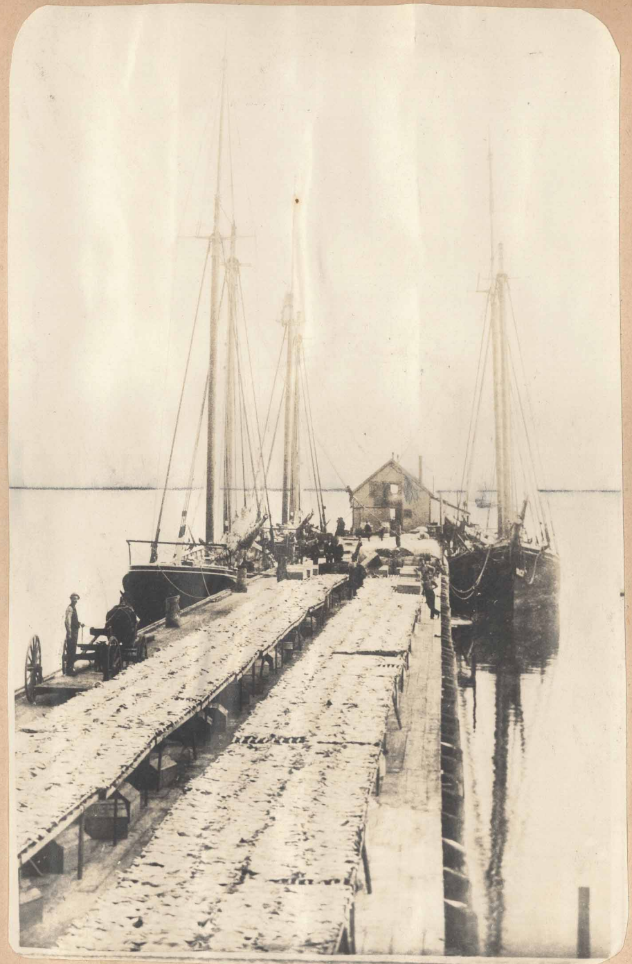
Codfish Flakes drying on Hilliard's Wharf - 1890