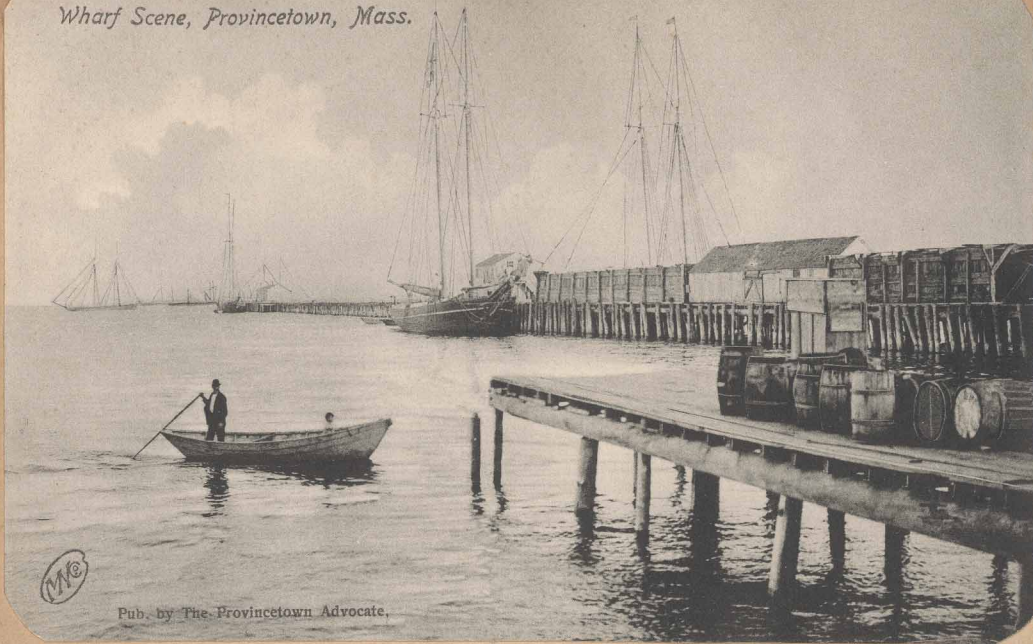
Wharf Scene, Provincetown, Mass.