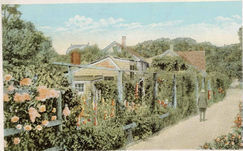
47 A PICTURESQUE LANE, PROVINCETOWN, CAPE COD, MASS.