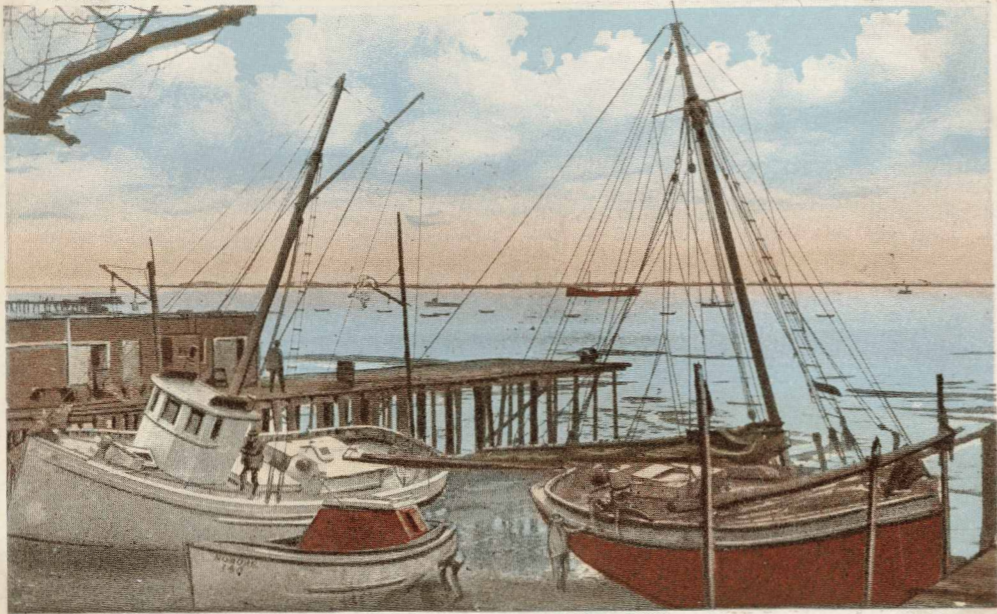
FISHING BOATS MAKING READY, PROVINCETOWN, MASS.