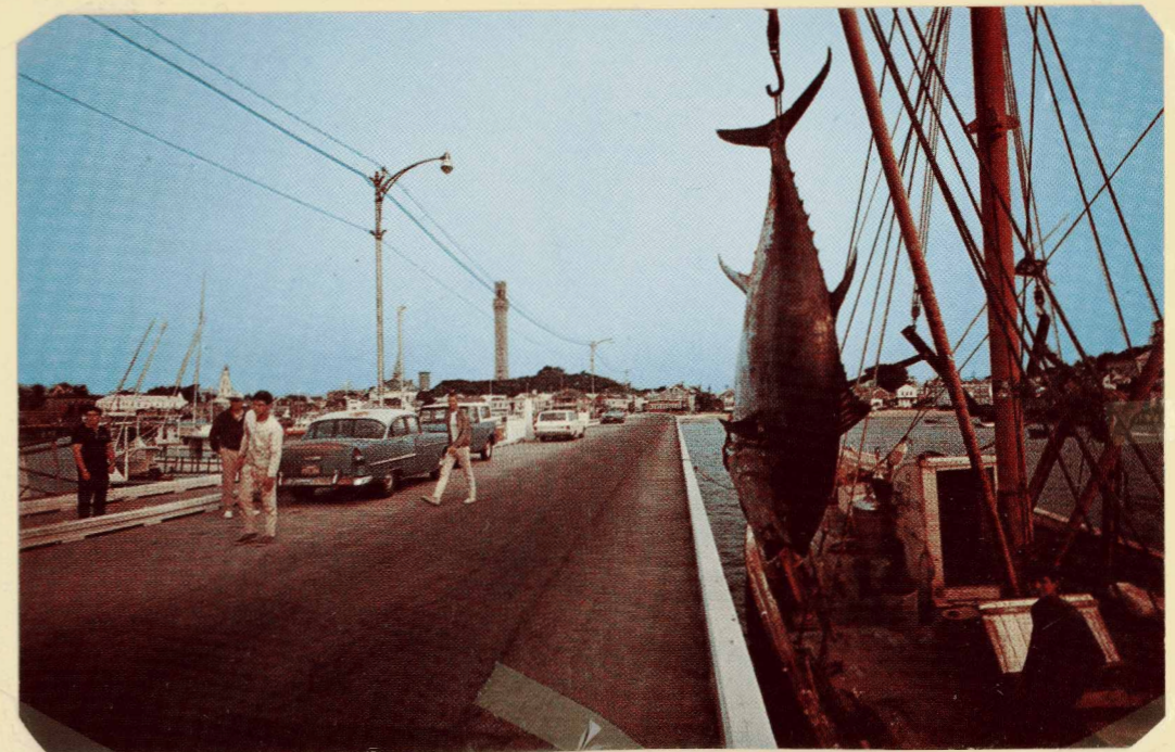
A Horse Mackerel - "Tunafish" the now fancy name. -1963 -