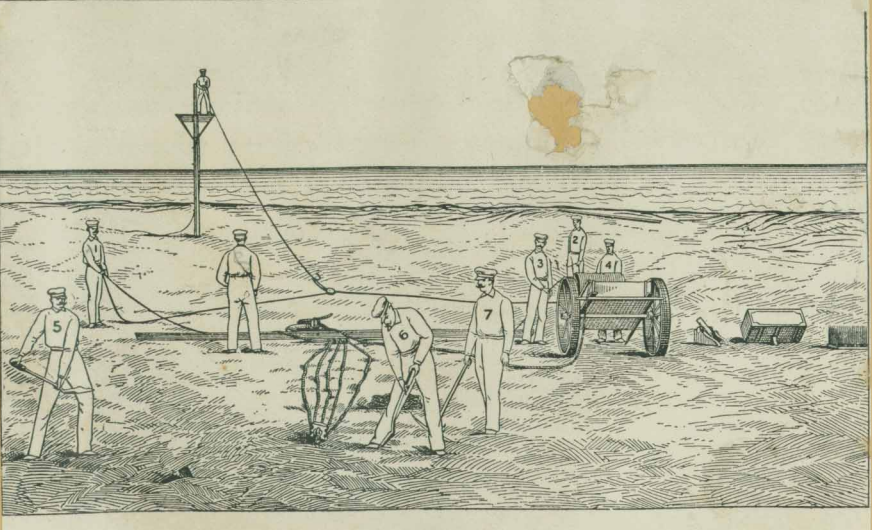
HAULING OFF WHIP. FULL CREW OF LIFE SAVERS PRACTICING WITH BREECHES-BUOY,