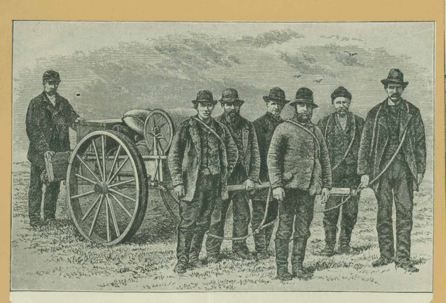
ONE OF THE FIRST LIFE-SAVING CREWS.

The "cut throughs" in the beaches, places where during storms