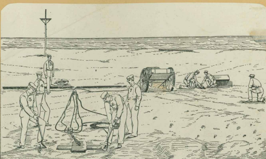
RELATIVE POSITIONS OF MEN WHILE PLACING APPARATUS