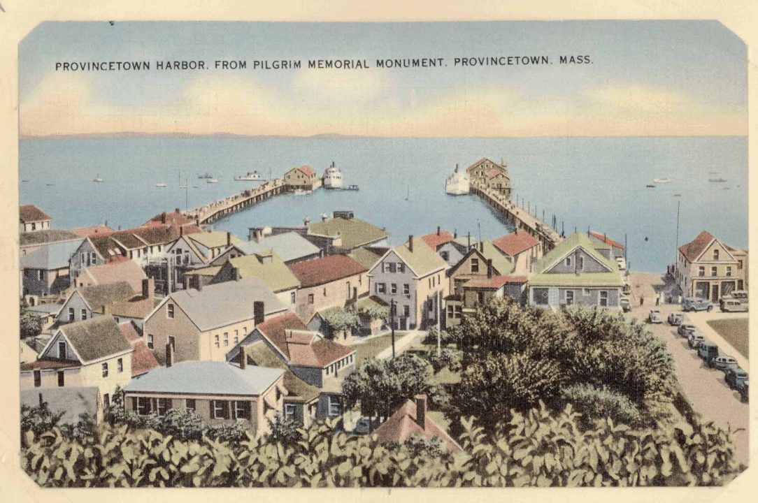
1945 with a Steamboat at Town & Sklaroff's Wharves