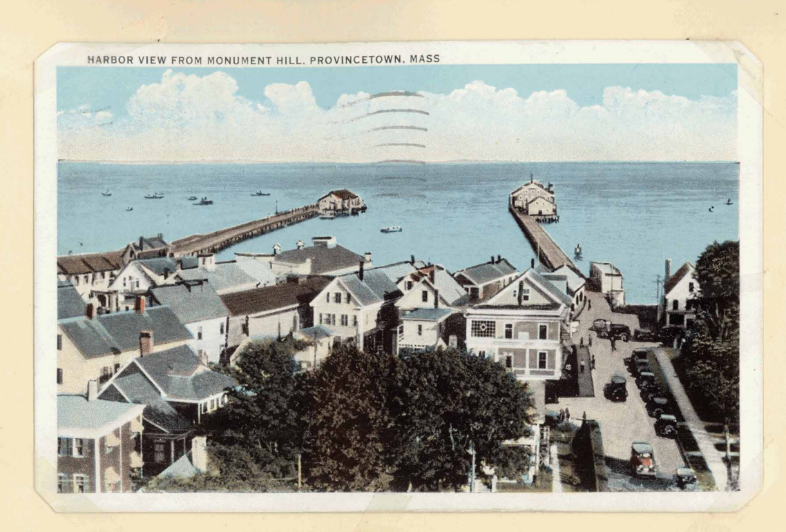
The Two Wharves in 1930