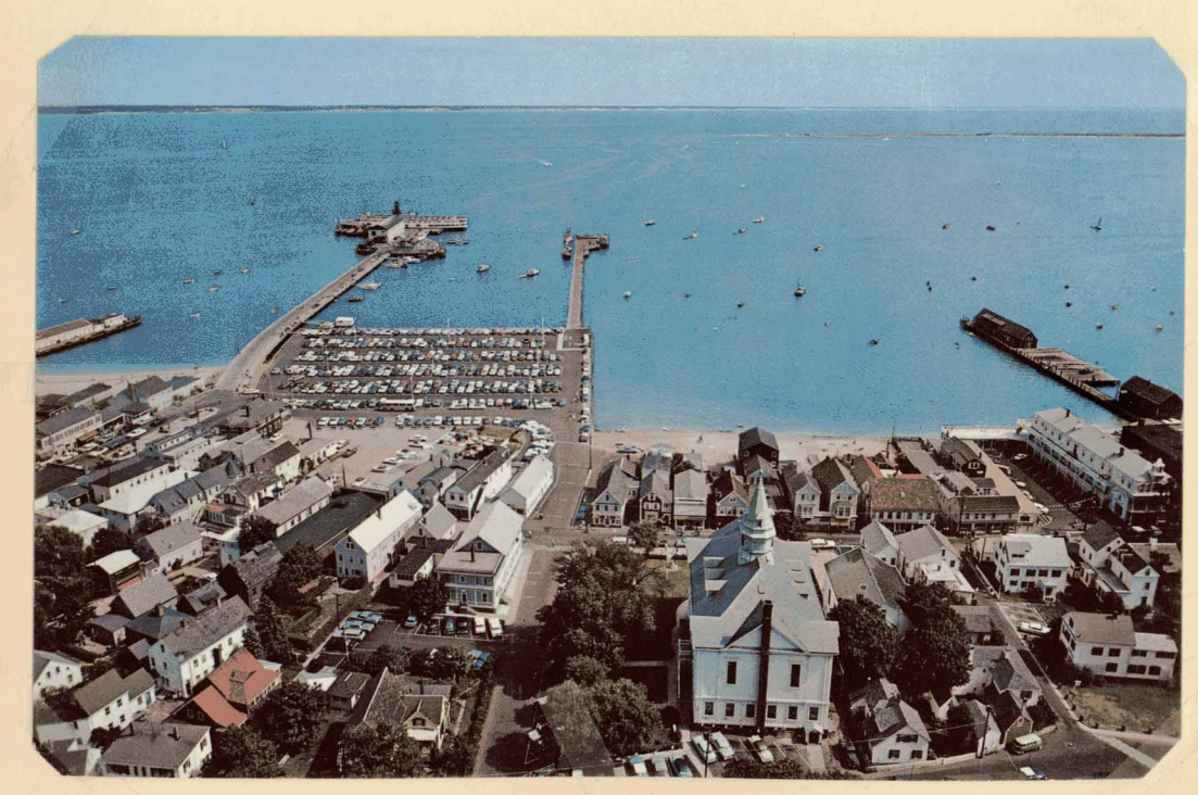
Showing the New Parking Lot between the two Wharves in 1965 - "Boston Belle" at Town Wharf