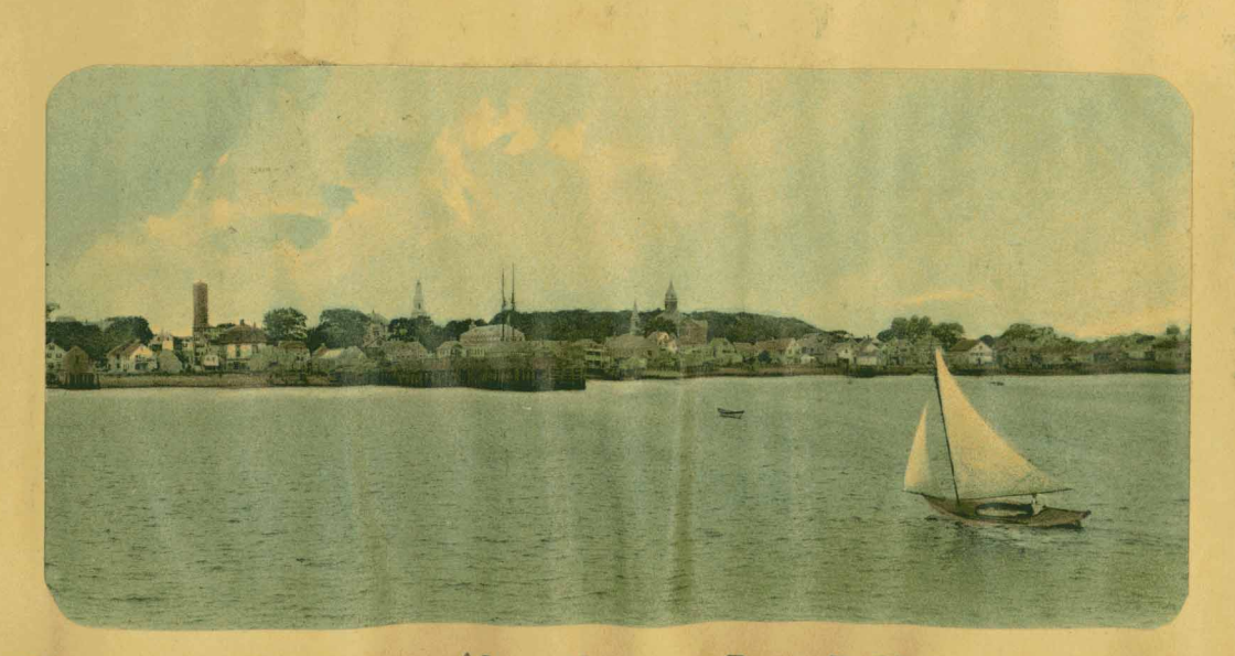
Also the new Town Hall below it.