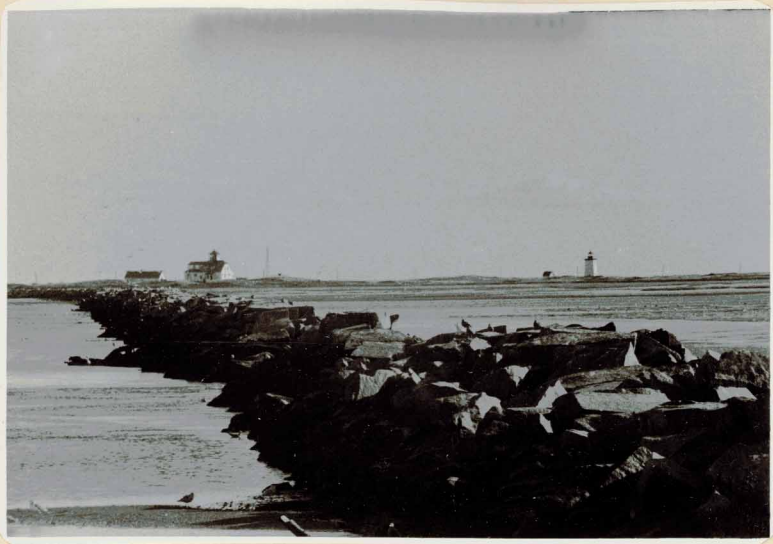
Wood End Light and Life Saving Station Note Keeper's House at the Light has been moved. Oct. 19, 1956