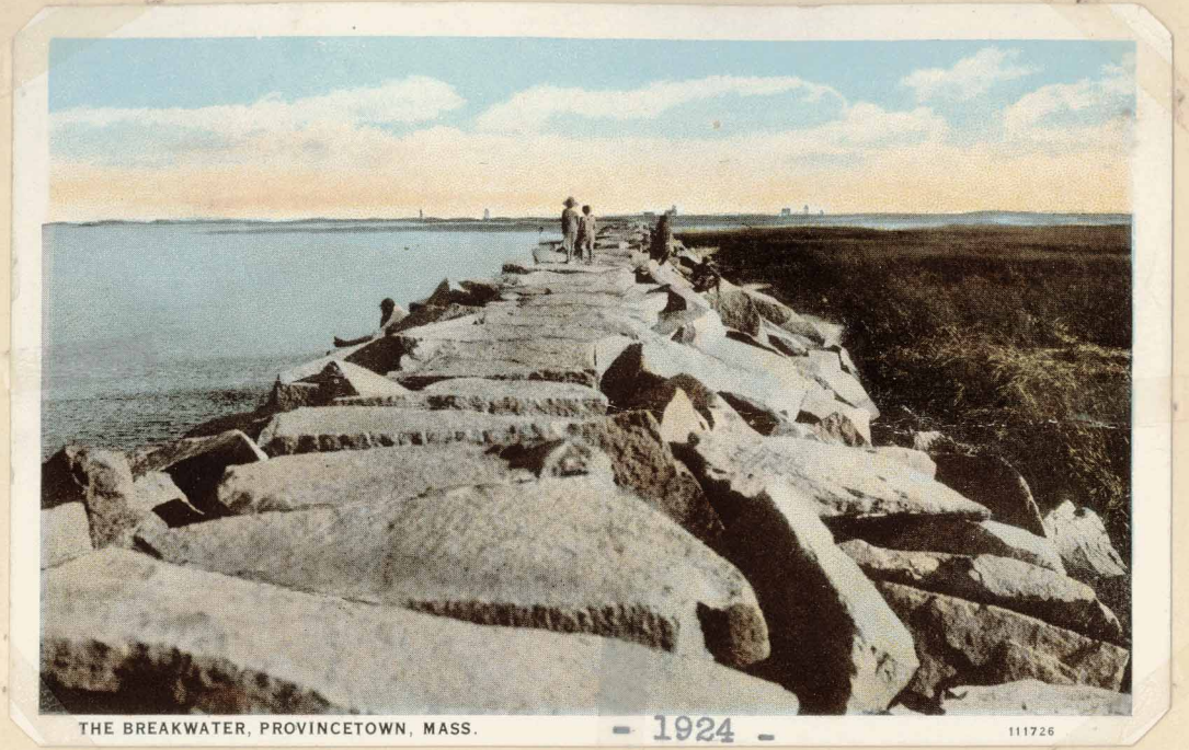
THE BREAKWATER, PROVINCETOWN, MASS.