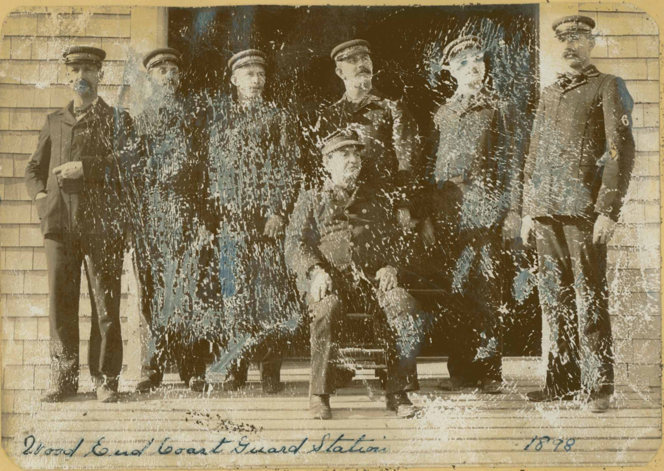
Wood End Coast Guard Station 1898