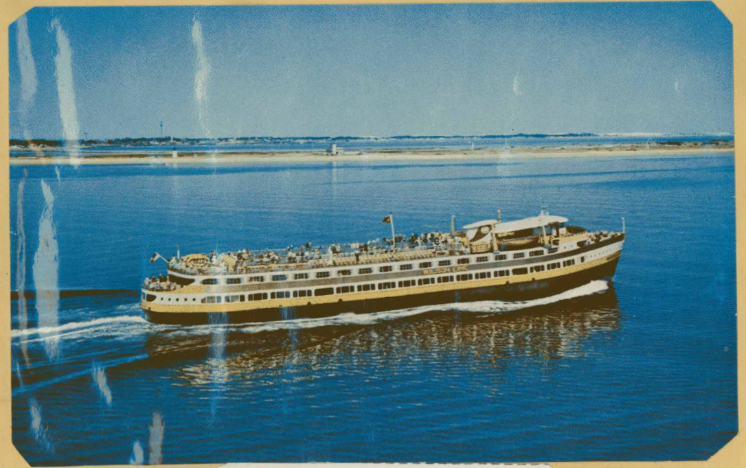
Boston Belle passing Wood End Light & Coast Guard Station on its way into Provincetown. Pilgrim Monument in background - 1957