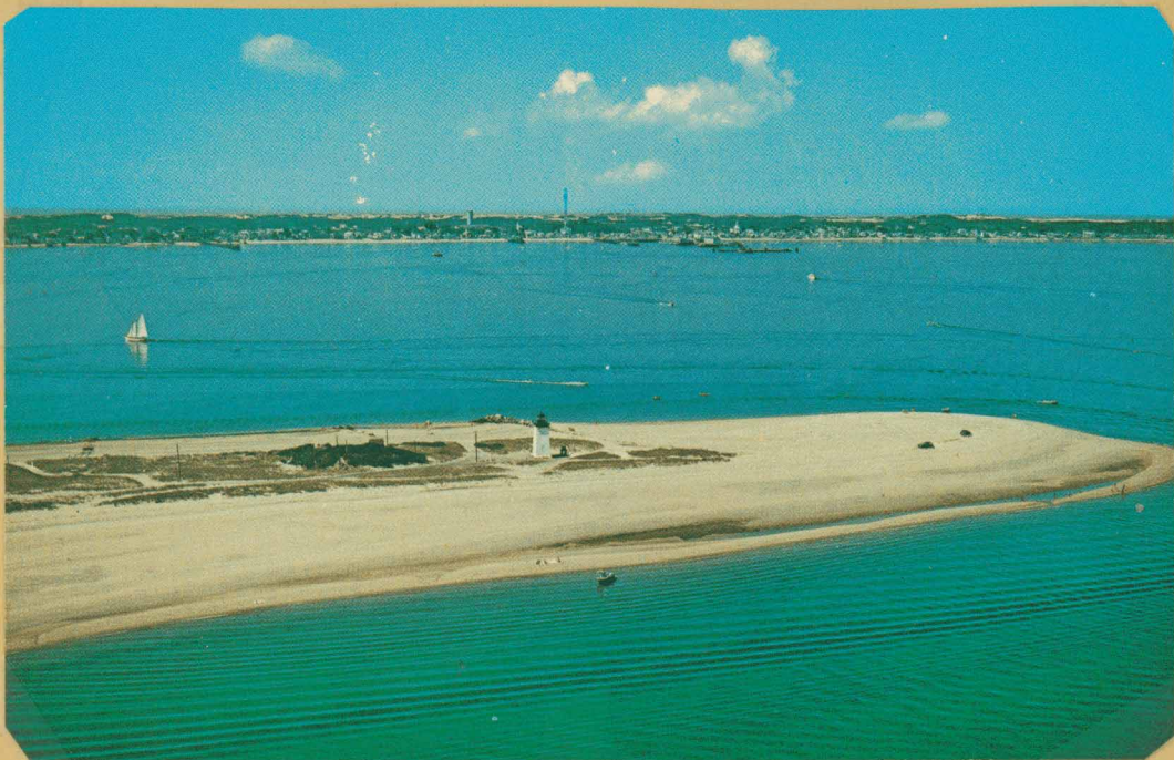
Long Point from the air with Pilgrim Monument in the background - 1976