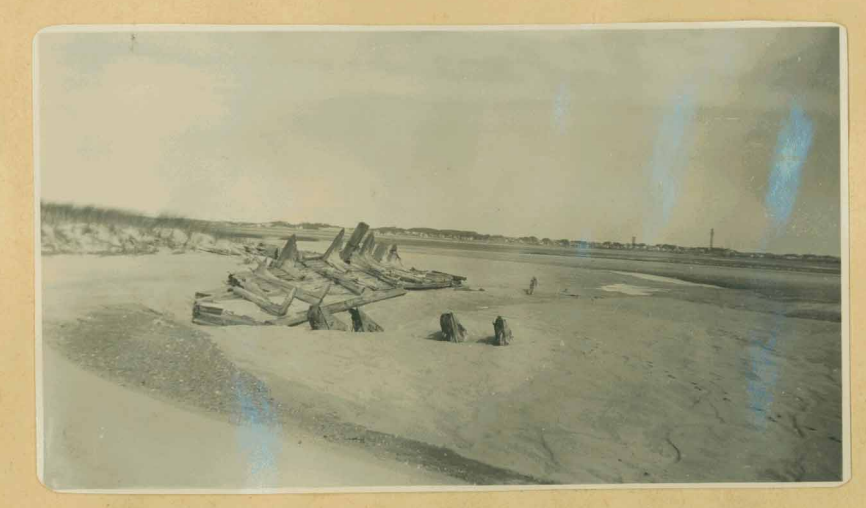
A wreck on inside of Long Point, facing Town. Note Standpipe and Monument.