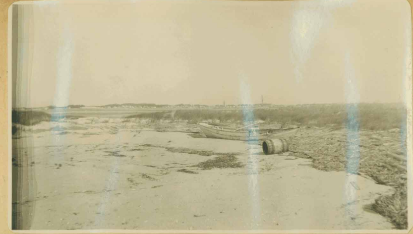
Abandoned rowboat before end of Point - 1944. Standpipe and Pilgrim Monument in background