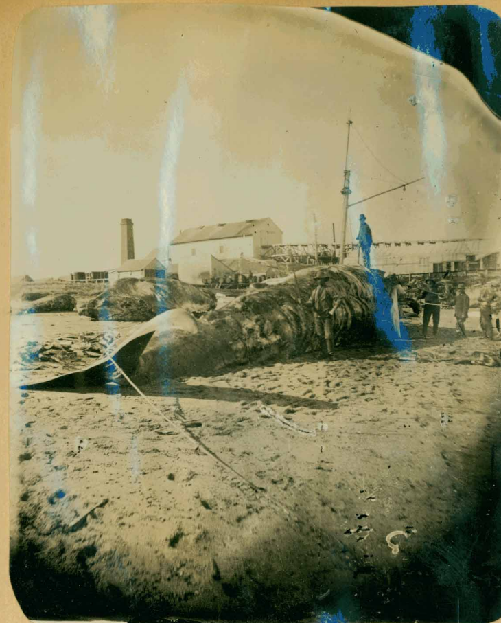
Jot Cook's Cape Cod Oil Works, located on the bay side of Long Point -- 1880 -- Note town hill in the background. Notes from Jennings' "Provincetown" book: "John Atwood built a wharf on the north side of the Point, which is standing today (1890) used by the Cape Cod Oil Works, the only buildings now left excepting the lighthouse..... Government now lays claim to all the lands on the Point.... No industry is carried on there but the Cape Cod Oil Works, and no fish of any amount have been taken there for many years, except a few cod off Wood End Lighthouse."