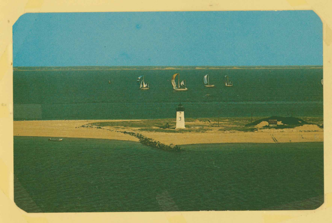
Another of Long Point Light, with one of the old Forts on the rihgt - 1976