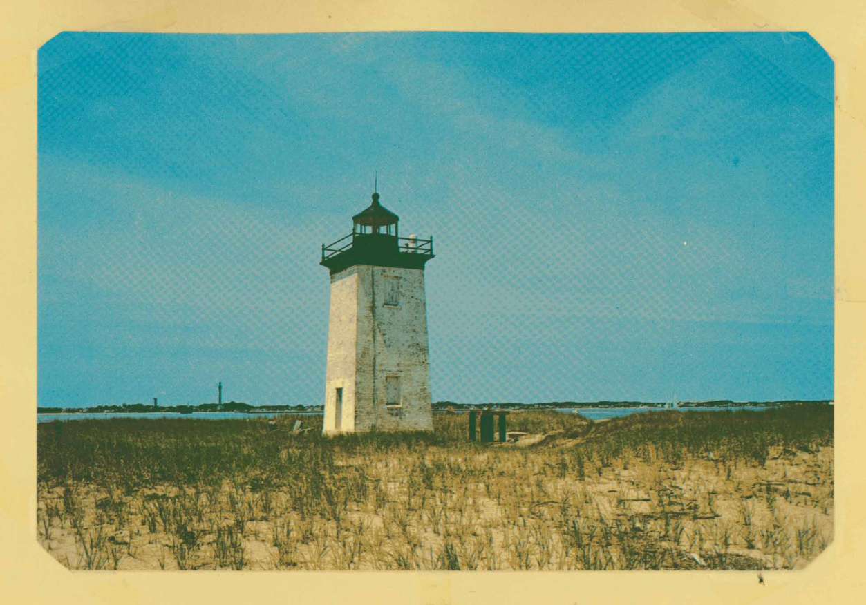
* 1976 *

Provincetown Advocate, Thursday, February 2, 1978