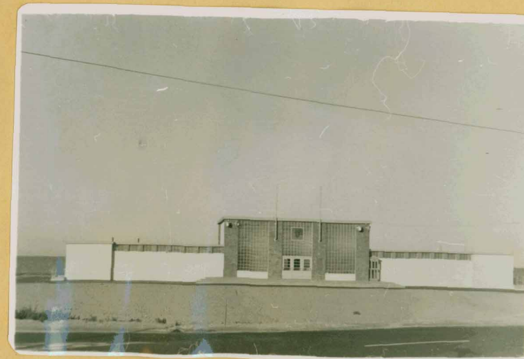
Front of New Bathhouse - Sept. 1953