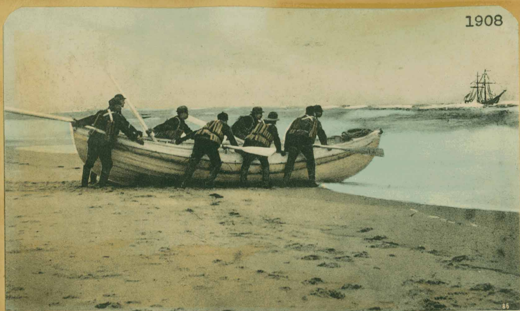
Launching of Lifeboat.