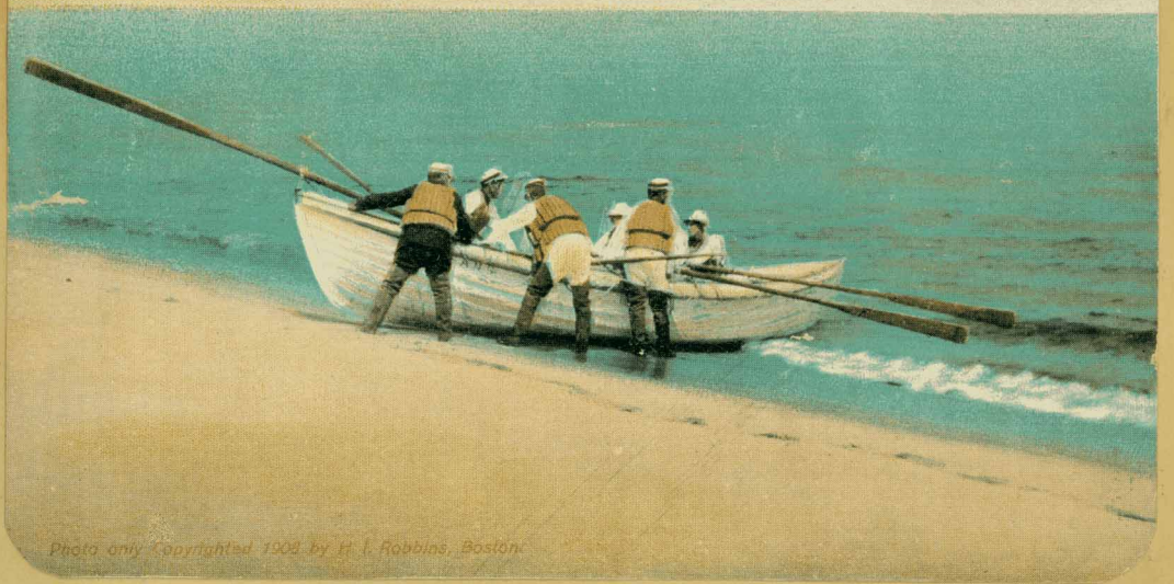
Surf Boat Drill.