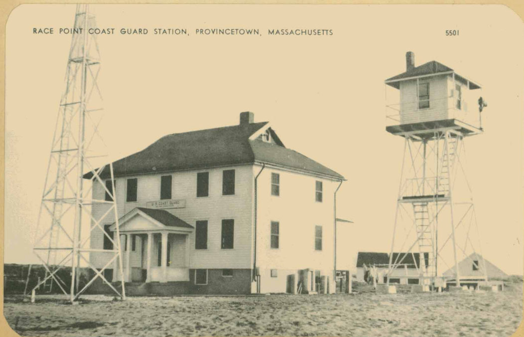
RACE POINT COAST GUARD STATION, PROVINCETOWN, MASSACHUSETTS