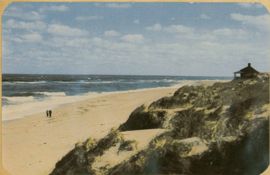
From Race Point Coast Guard Station facing Peaked Hill Bars - 1949