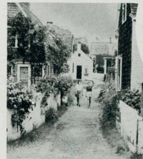
Narrow streets and winding ways among houses that tell a story

Exciting Beach Buggy Ride Through the Scenic Dunes — an Unforgettable Experience Included in all Tours