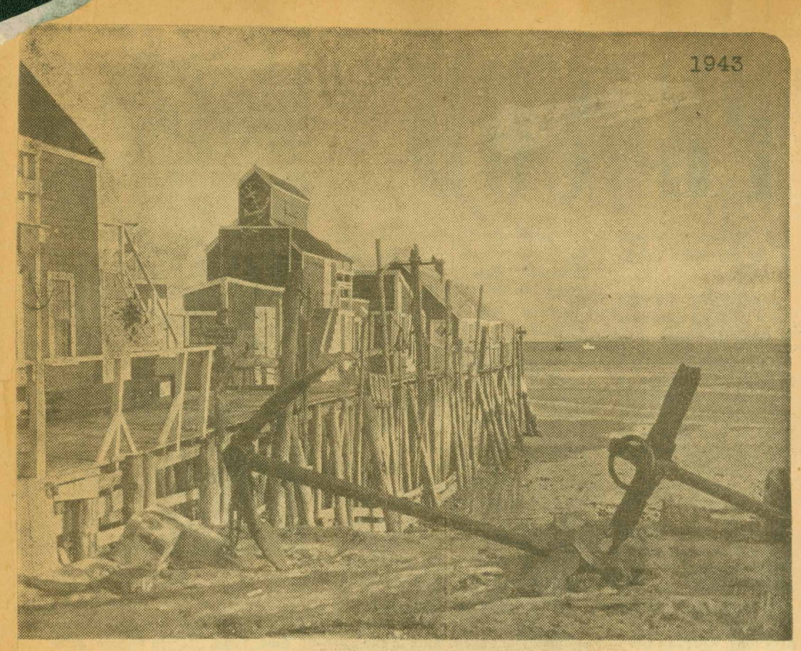
Capt. Jack's Wharf in Provincetown has become Studios-by-the-Sea in recent years. In the narrow top section of the tall building, in the old days, fish was hung up and smoked. This photogenic spot is fast becoming a rival to the famous Motif No. 1 in Rockport.