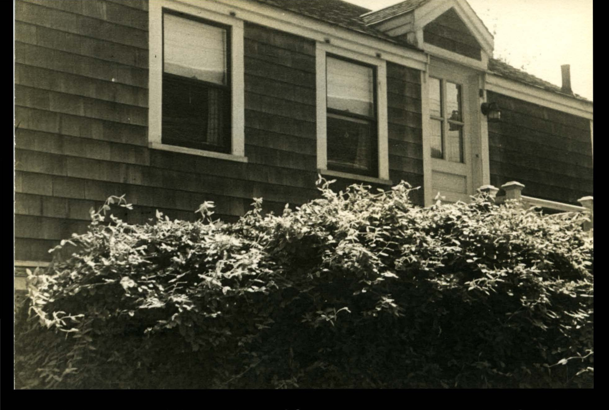
40 Commercial Street - Second floor rear apartment on Point Street circa 1945-6 Honeysuckle hedge