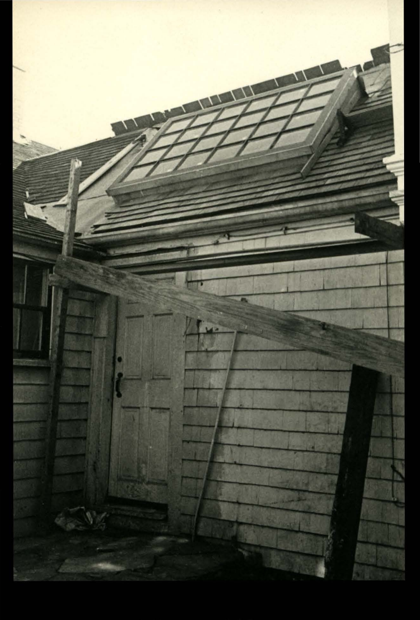
40 Commercial Street circa 1945-6 - undergoing renovations Installation of multi-paned skylight