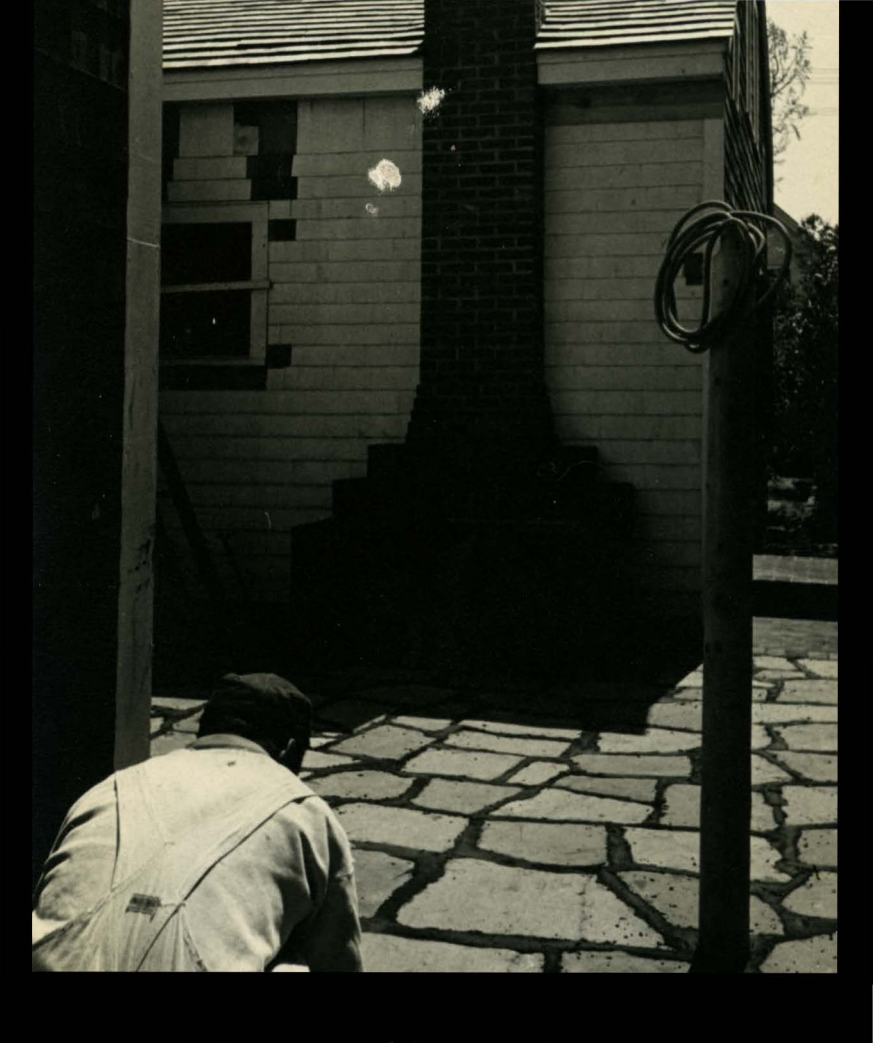
40 Commercial Street - circa 1945-6 Patio flagstone being laid