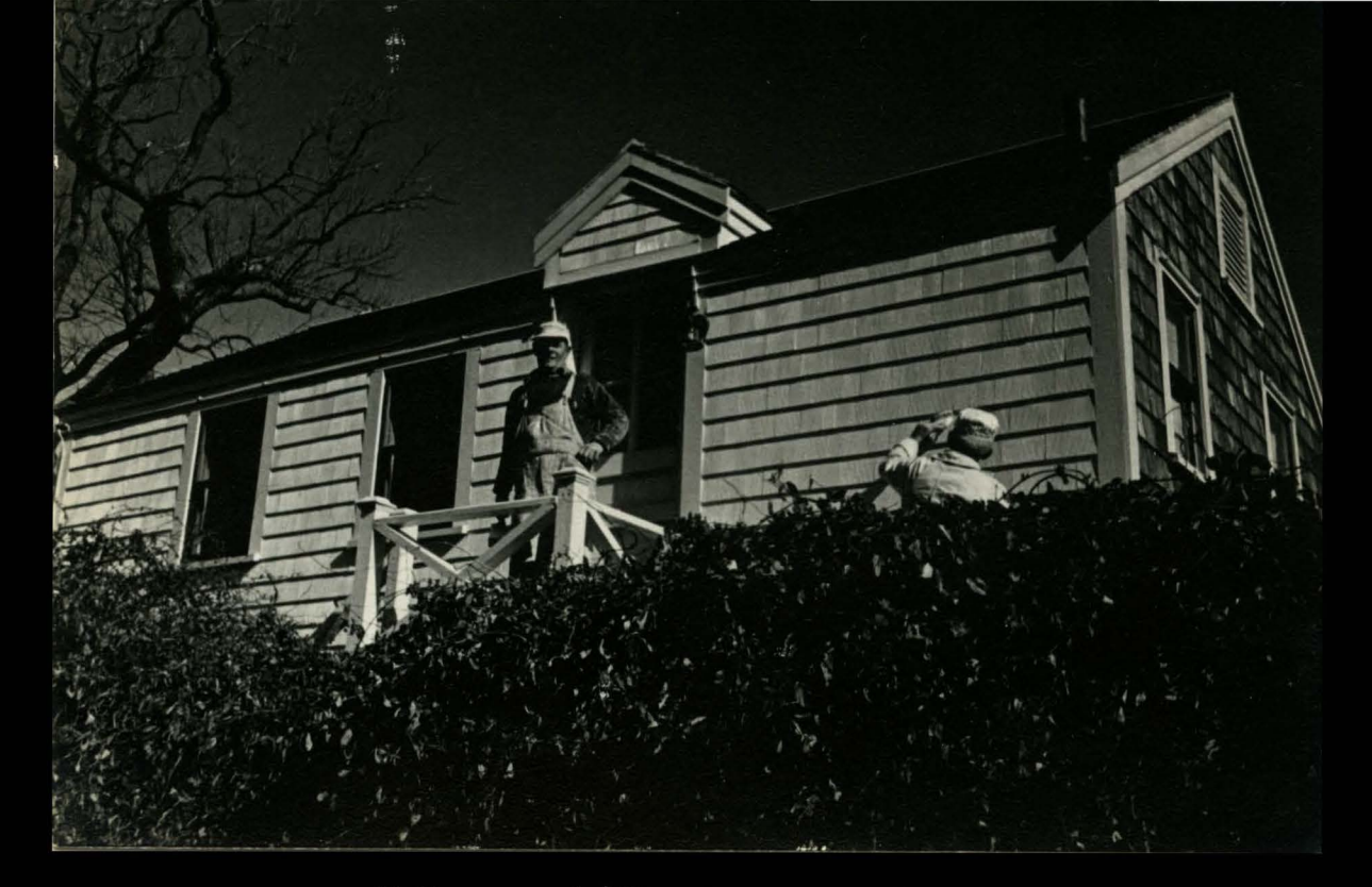
40 Commercial Street - rear apartment circa 1945-6 - getting a fresh coat of paint